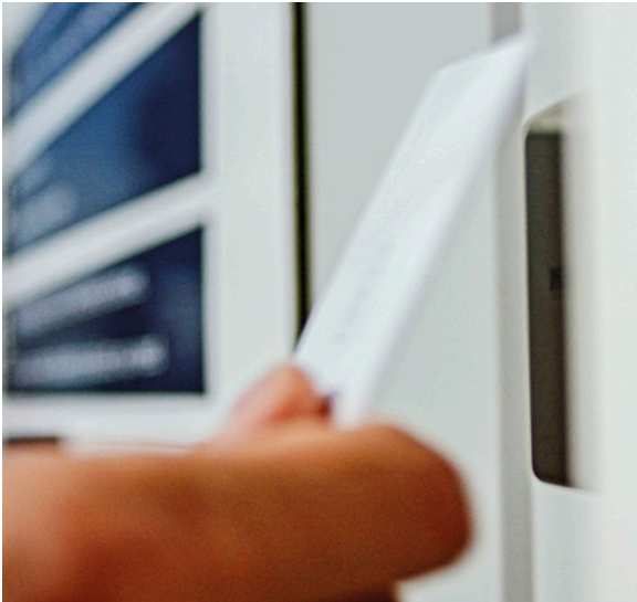
On accessing the store, employees identify themselves with their RFID card